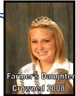
Farmer's Daughter Crowned 2008

STATE OF CALIFORNIA 46 th District Agricultural Association 18700 Lake Perris Drive • Perris, California 92571