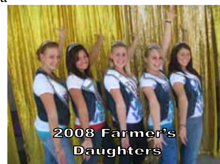
2008 Farmer's Daughters

APPLICATION DEADLINE: Wednesday, July 22, 2009 by 4:00pm (Postmarks not accepted)